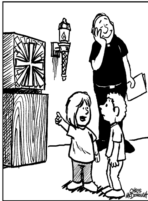
"That's the place where they keep the bread of life, and that's why it's called the pumpernickel."

© 2002 World Library Publications, a division of J. S. Paluch Co., Inc.